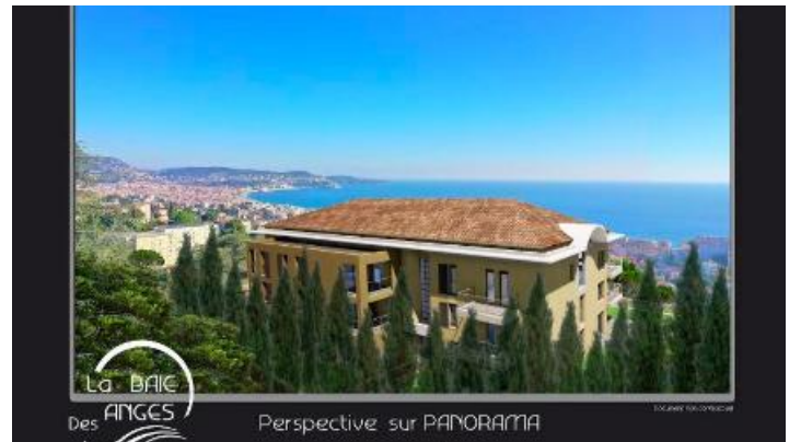
Perspective sur PANORAMA