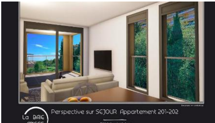
Perspective sur SEJOUR Appartement 201-202